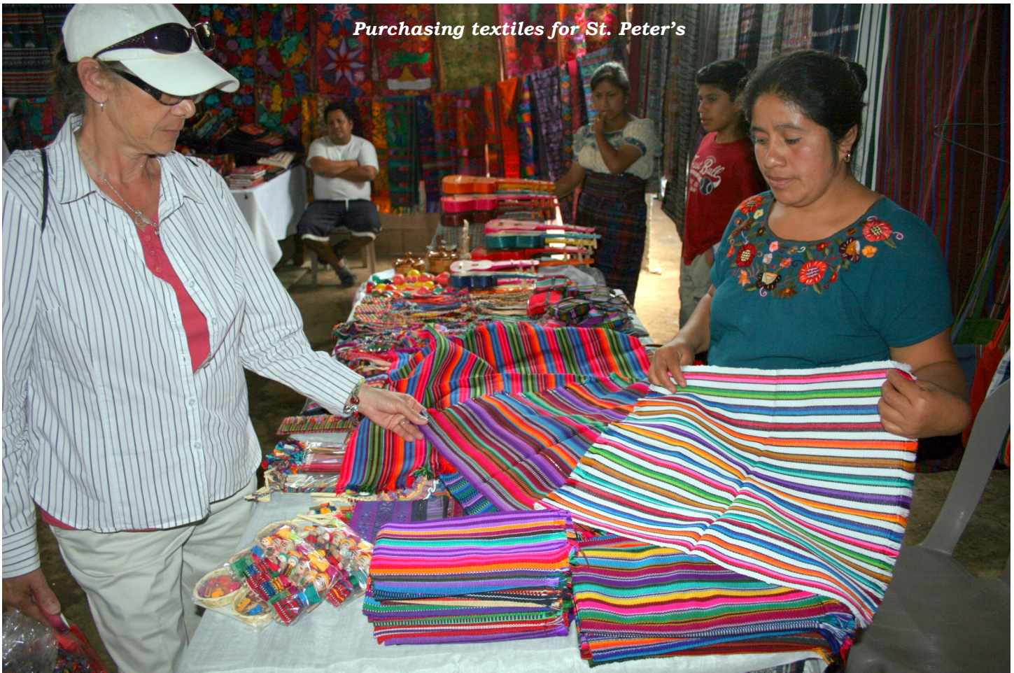
Purchasing textiles for St. Peter's