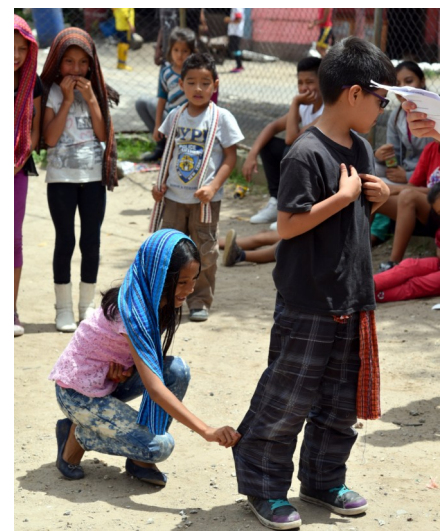
Pinito Children Acting Out A Bible Story