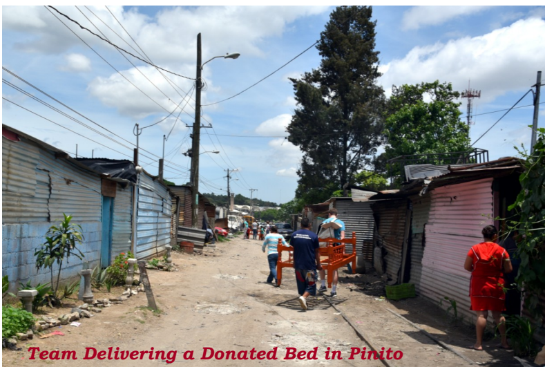
Team Delivering a Donated Bed in Pinito